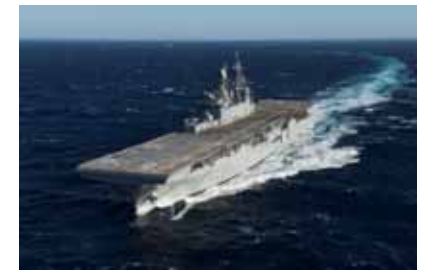
LHA 6 Amphibious Assault Ship