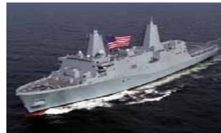
LPD 17 Class Amphibious Transport