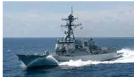
DDG 51 Surface Combatants