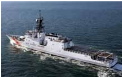
USCG National Security Cutter