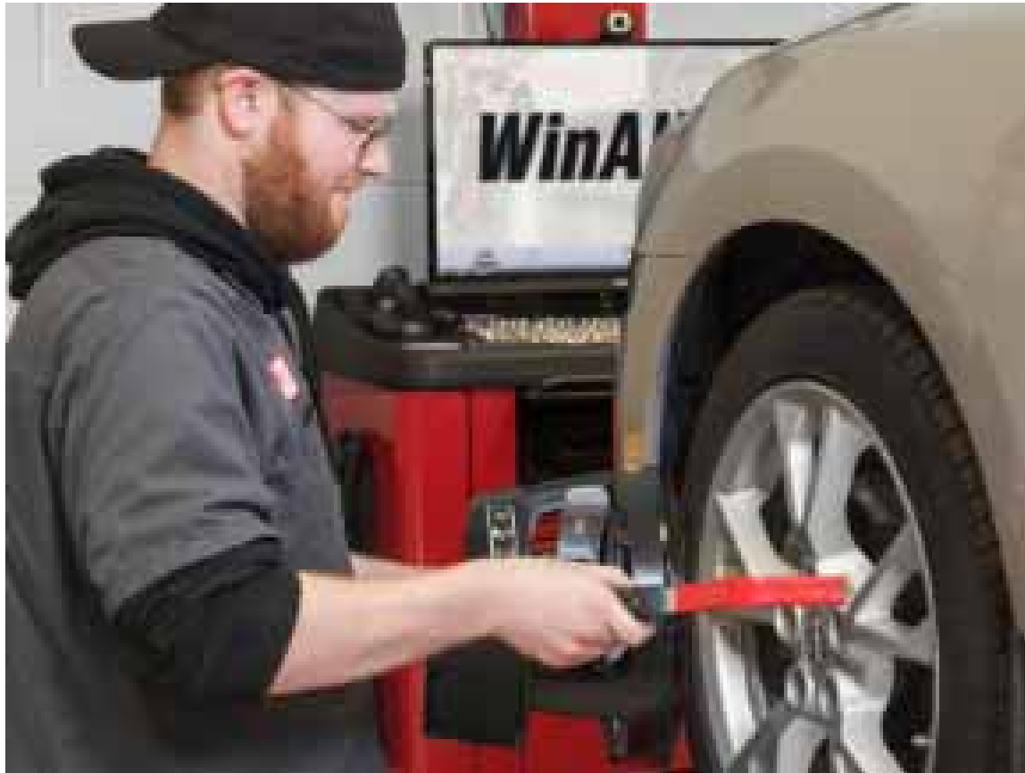
FRONT END ALIGNMENT EQUIPMENT