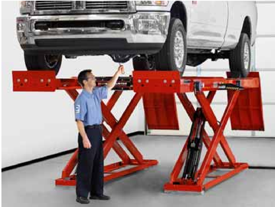
RX LIFT RACK