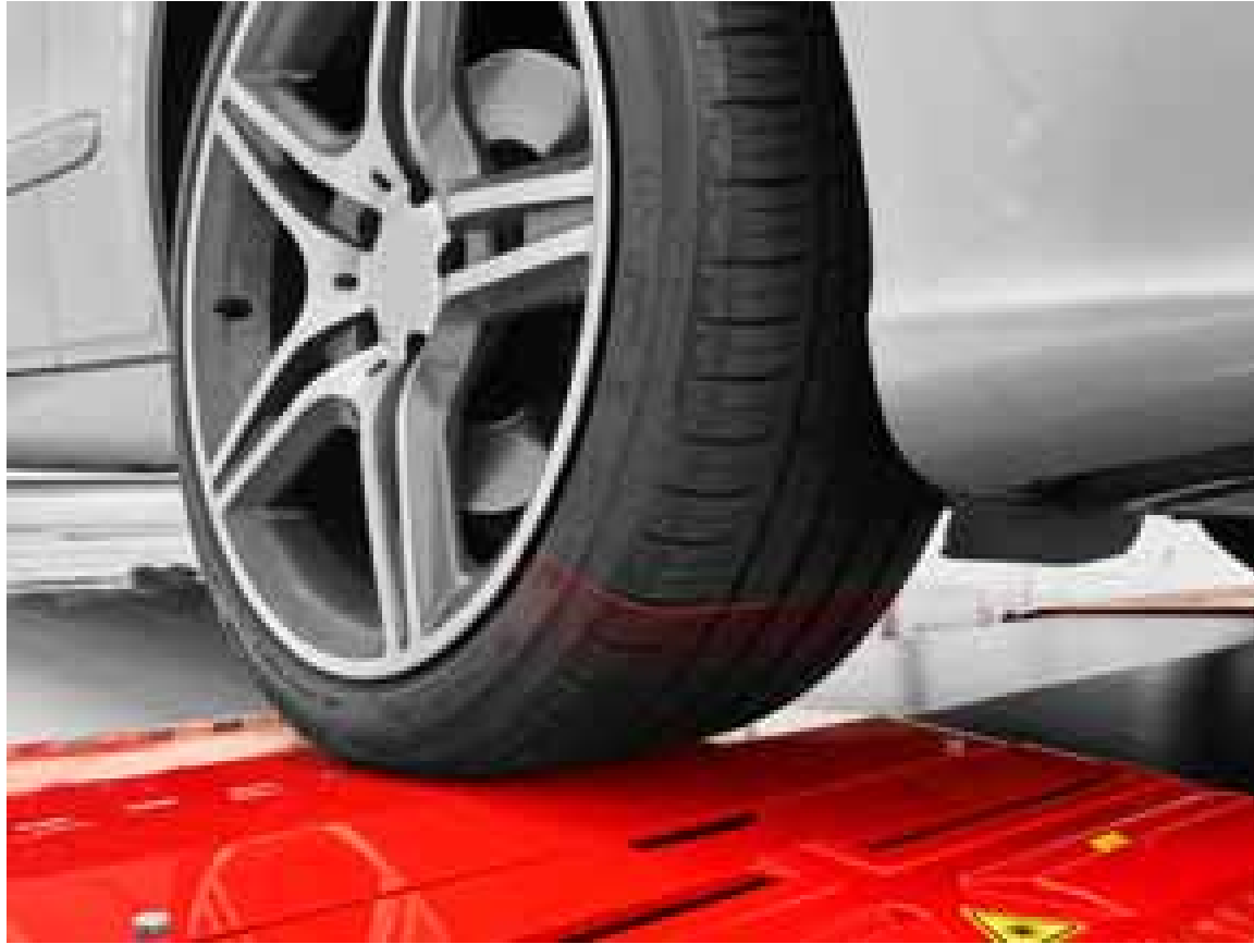
TREAD DEPTH CHECK